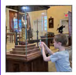
All administration, teachers staff and students were able to venerate the relic of St. Jude!