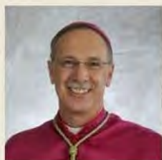
BISHOP RAFAEL ZARAMA Diocese of Raleigh Celebrant