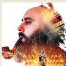
E-KNOCK Catholic Rapper