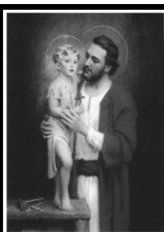
Year of St. Joseph: Walk to Bethlehem with the Holy Family