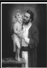
Year of St. Joseph: Walk to Bethlehem with the Holy Family