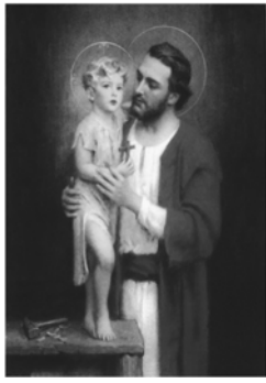
St. Joseph Patron of Dying and Solace of the Afflicted