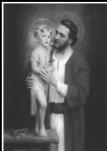
St. Joseph Patron of Dying and Solace of the Afflicted

Retrouvaille helps couples through difficult times in their marriages. It is designed to help get your marriage back on track. For information, call: 800-470-2230, email: retrouvailleenc@msn.com or visit: www.helpourmarriage.org .