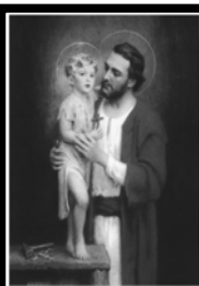
Mirror of Patience

Tabs for Douay Rheims version of the Bible: Do you use the Douay-Rheims version of the Holy Bible and desire Bible tabs that accurately reflect the ancient names of the Books, such as Paralipomenon, Apocalypse, Habacuc, and Aggeus? A fund has been set up to manufacture high quality Douay Rheims bible tabs (Old & New Testaments) to aid with devotion and study. A donation of $15 will get you one set ($30 for two, etc). Please see: https://wonderwe.com/DRBibleTabs .