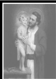
Joseph Most Faithful