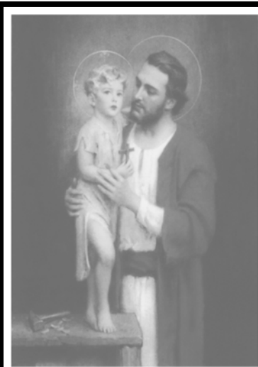
Joseph Most Just

Good St. Gerard, powerful intercessor before the throne of God, pray for us.